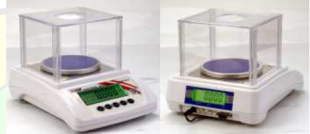
EJB-FRH 600 (600 g x 0.005g) with Front & Rear LCD display

ENDEL will now be able to provide many new models for Jewellery Scales' Market in coming months. However, ENDEL has already launched its new model EJB-FRH in Jan., 2007.